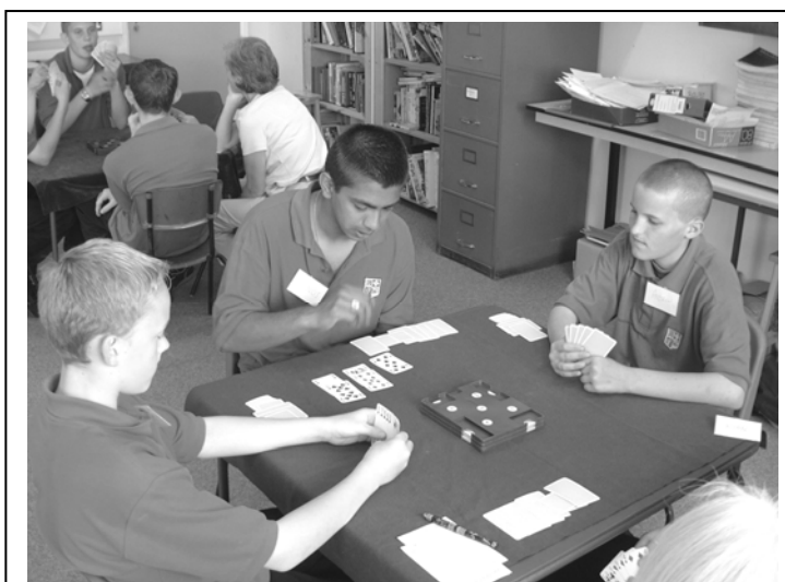
MiniBridge at St Cyres School in Penarth